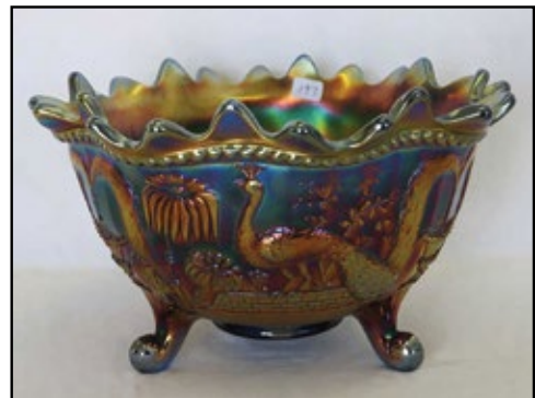
197. Renninger Blue Peacock at Fountain fruit bowl