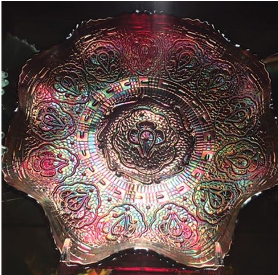
Red ruffled Persian Medallion bowl

them. Here we go again. I'm not traveling 1500 miles. I explained my situation, and they again said they would not ship. Well...as money talks, I offered them four times their asking price, which was still a hell-of-a-bargain. Now they will ship, however, with no guarantee it would arrive safely. Money was exchanged through Western Union, and the deal was sealed. I explained how to package it, and it arrived two weeks later safe and sound.