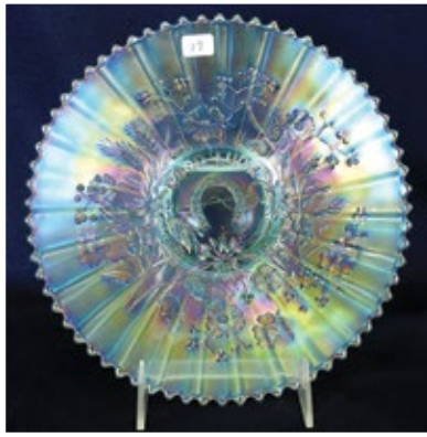
19. Ice Blue Good Luck plate