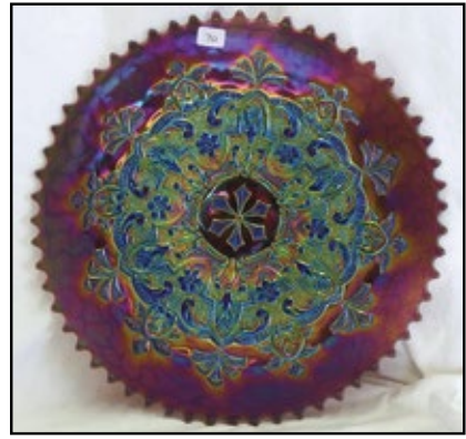
70. Garden Path Variant chop plate