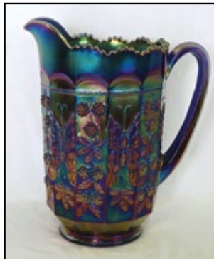
64. Blue Butterfly and Berry pitcher