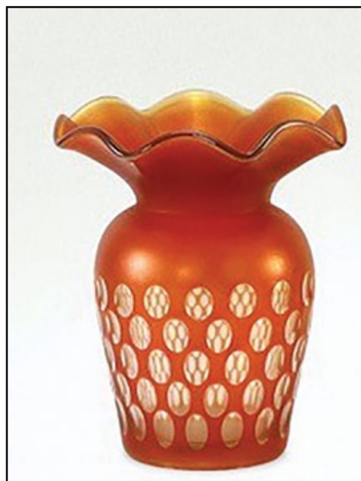
Sweet Pea Vase in Pearl Ruby with cut ovals