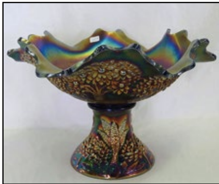
254. Orange Tree whimsy punch bowl