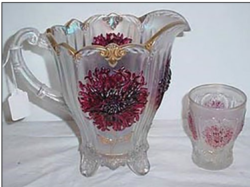
Pastel marigold Petal and Fan, above left. Above, white with red stained Dahlia pitcher set. Below, blue Dahlia pitcher set and right, blue berry set.

There are at least four versions of 'old' white Dahlia pieces. I'm guessing, but I'll list them in ever increasing rarity. Don't get me wrong, it's my opinion that all 'old' white Dahlia pieces are either scarce or rare, some are just rarer than others. Okay, most frequently seen would be white pieces with no 'decoration' on the