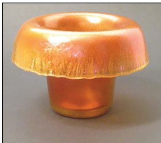
Nasturtium Vase in Pearl Ruby